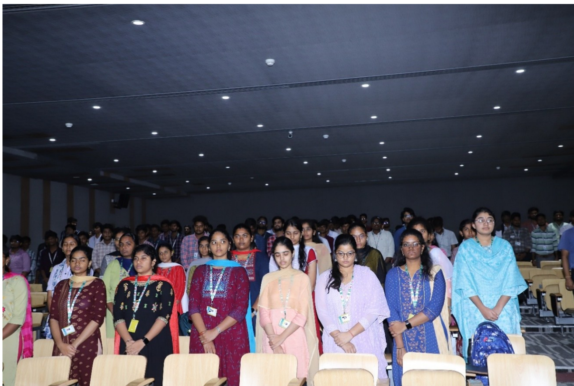
Prayer Song @ New Seminar Hall, KLEF