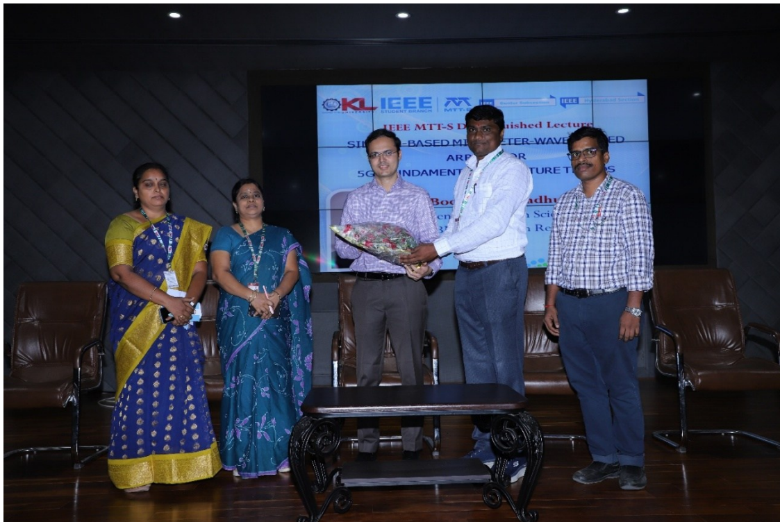
Hearty Welcome to our Chief Guest @ New Seminar Hall, KLEF

Admin Off: 29-36-38, Museum Road, Governorpet, Vijayawada - 520 002. Ph: +91 - 866 - 3500122, 2576129