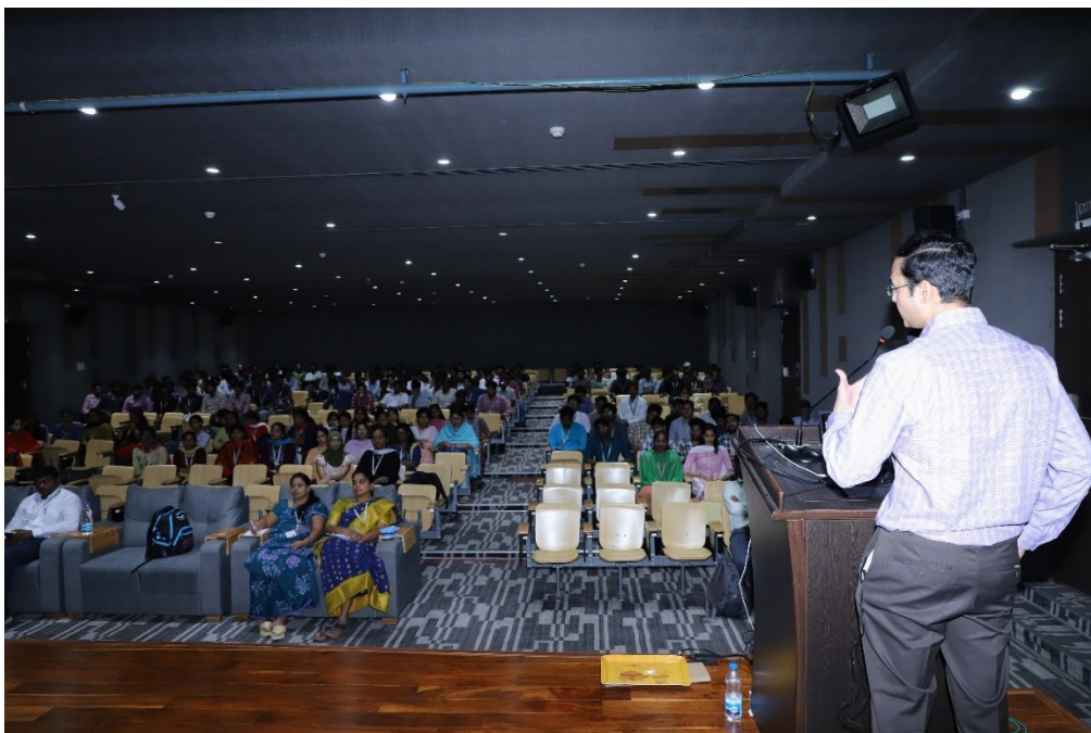
Interaction with our Students @ New Seminar Hall, KLEF